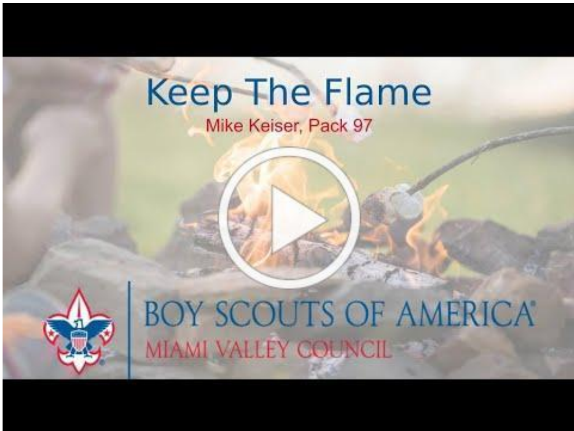
Keep the Flame Episode 10: Scouting for Food with Pack 97

Spark Session #10: Contact-Free Scouting For Food Drive with Pack 97 Cubmaster, Mike Keiser